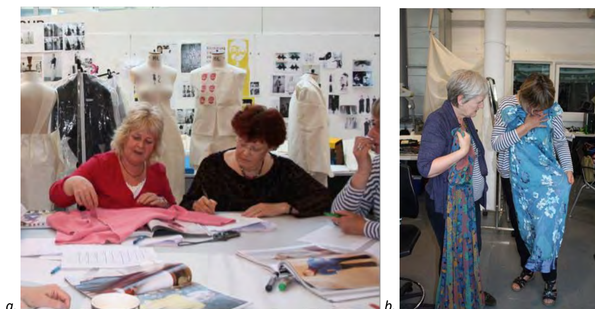
Figures 4 a-b Participants discussing their favourite items.

Alongside this activity, the participants had a chance to look at current fashion magazines such as Another Magazine, Vogue and Elle, and relate their needs and tastes to the various images, editorials and adverts presented in these publications. This provided a platform for our participants to directly compare the fashionable clothes on offer with items of clothing that are actually present in their wardrobes. Once again, for many this was a chance to express their dissatisfaction with the fashion solutions currently available on the market. On the other hand, these women presented a high level of creativity and widely commented that in fact they would buy some of these products but modify them according to their own needs, for example, by adding sleeves or elongating the shape of a garment. Overall, the