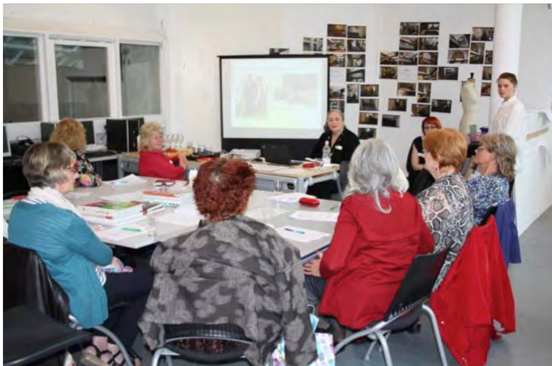
Figure 2: Participants introducing discussing their clothing preferences.

They also related to the skin, and its changing texture, density and decolourization through ageing. The participants also felt that the colours widely available in the shops often did not compliment their appearances; black and white were their classic/ regular choices, however, this was often dictated by the unsuitability of other colours rather than the participants' specific preferences. As indicated by the workshop participants, problems seemed to lie not in the colours per se but in their tonal range. In contrast, all of the women present expressed rather negative attitudes towards colours such as grey or beige through related descriptors of "granny-ish" and "boring". These shades, or 'neutrals' are considered as part of the staple colour palettes for the mature fashion market. Discussion around this issue raised interesting psychological perceptions between ageing and semantics, particularly the notion that once past a certain age women become "invisible" or "neutralised" within Western culture, perpetuated by a feeling that commercial fashion is not designed "for them".